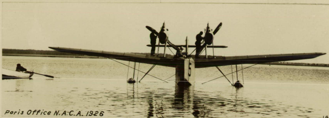
Paris Office N.A.C.A. 1926