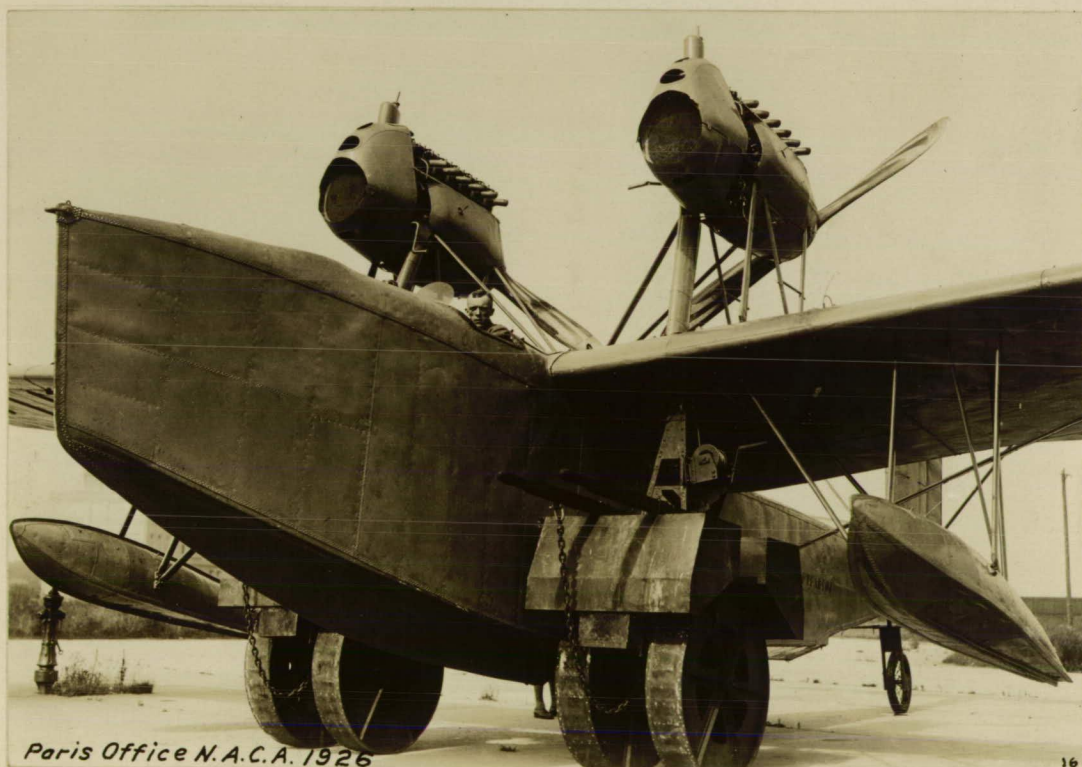
Paris Office N.A.C.A. 1926