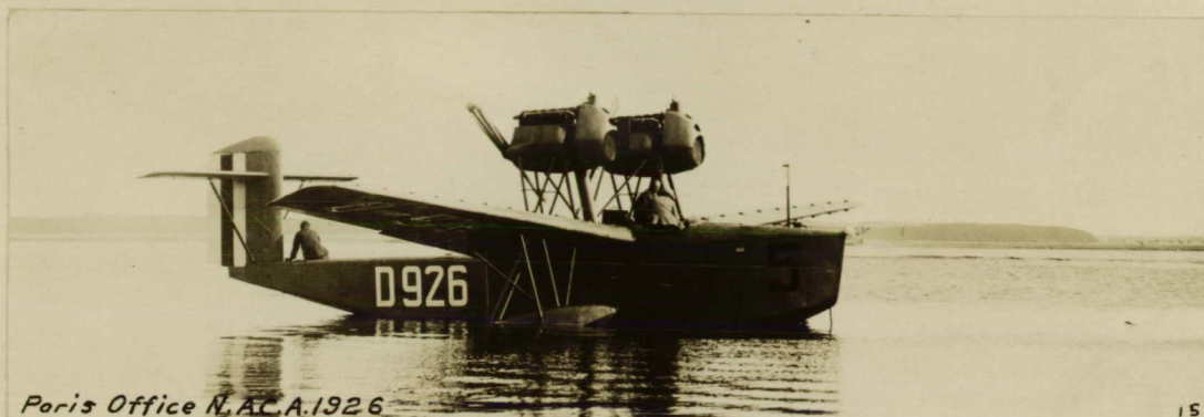
Paris Office N.A.C.A. 1926