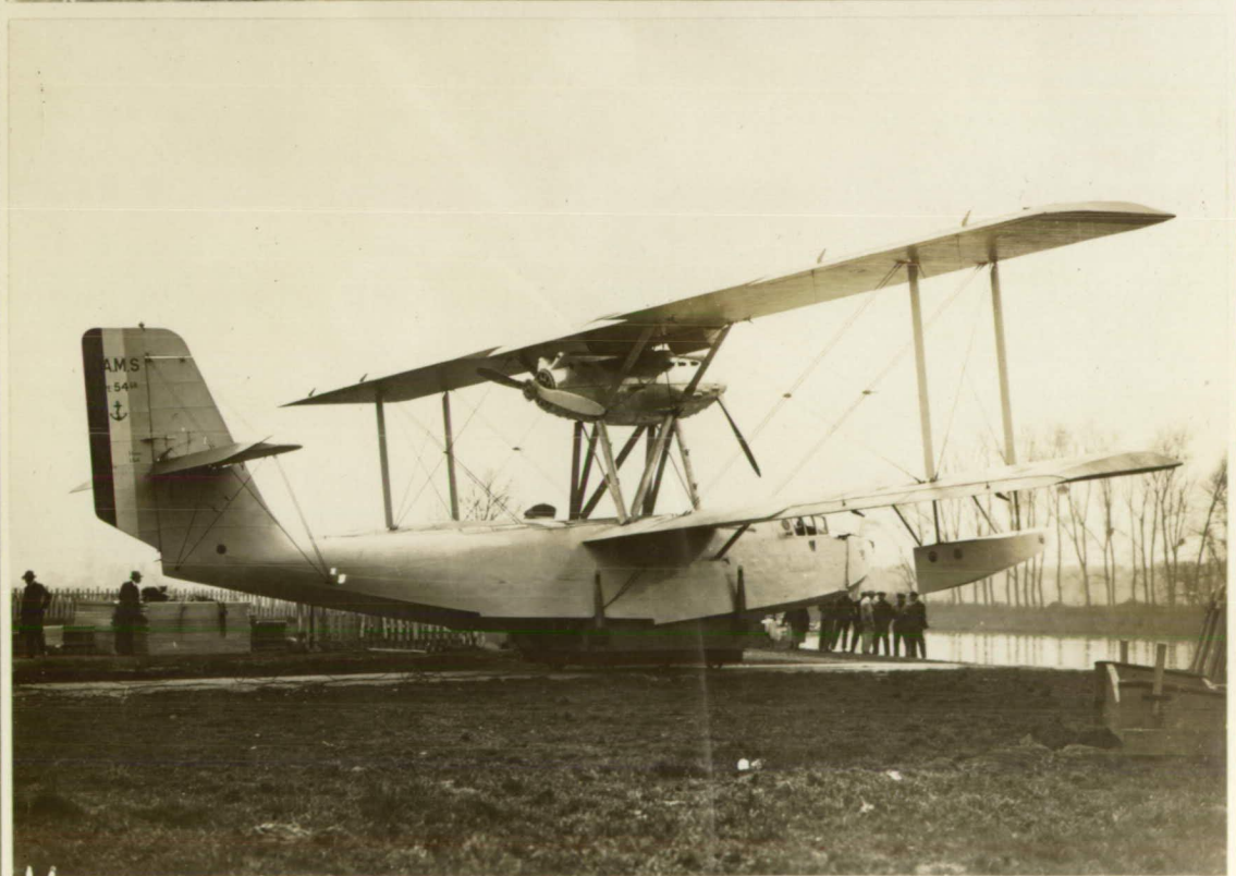
Figs. 2 & 3 Three-quarter views of the C.A.M.S. 54 G.R. seaplane with two 500 HP Hispano-Suiza eng. 6780 A.S.